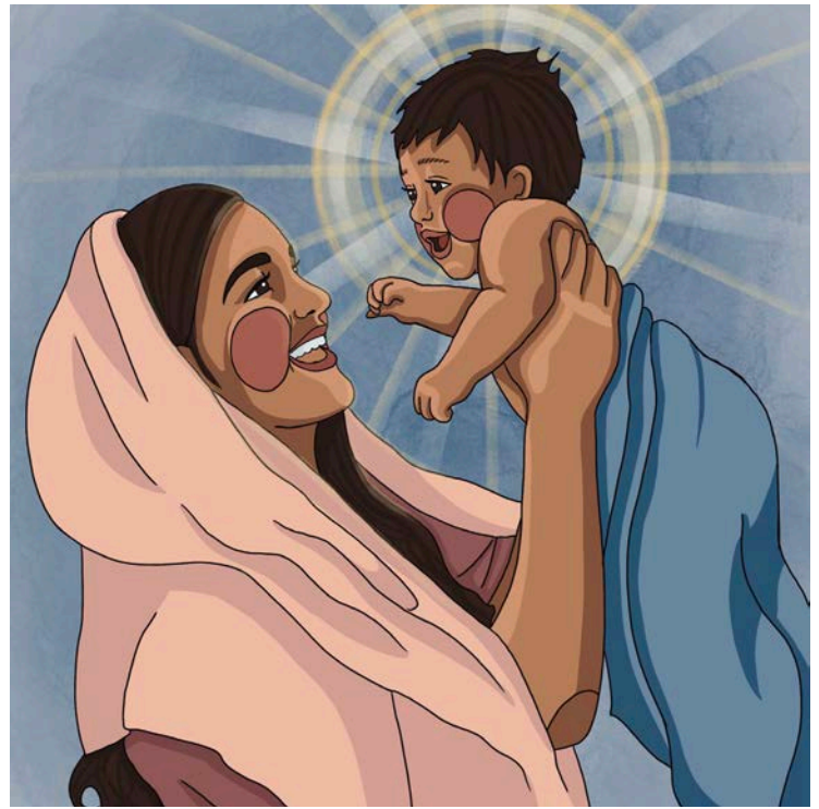
Firstborn, Only Begotten