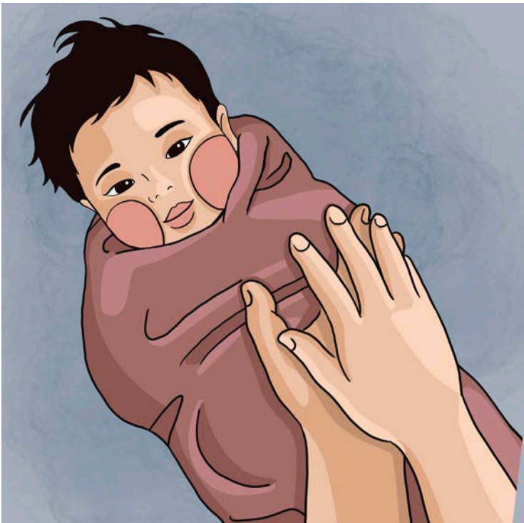
Sons & Daughters unto God